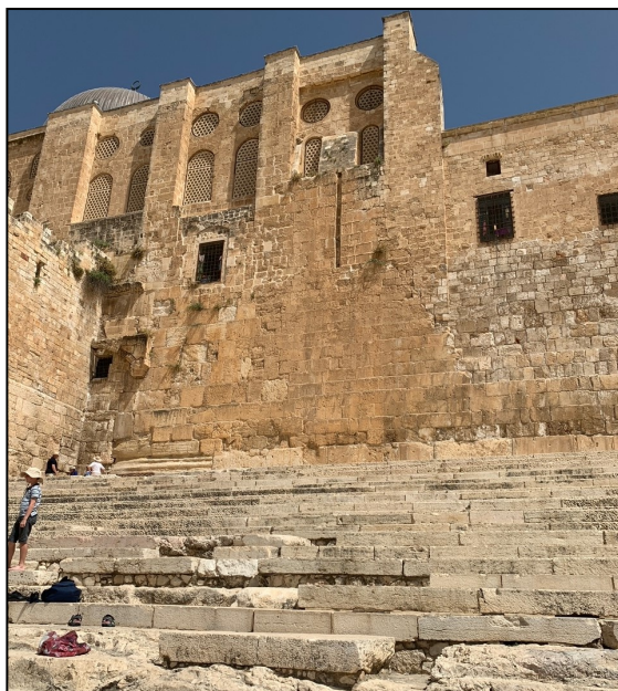
The possible location of the Pentecost event in Jerusalem.