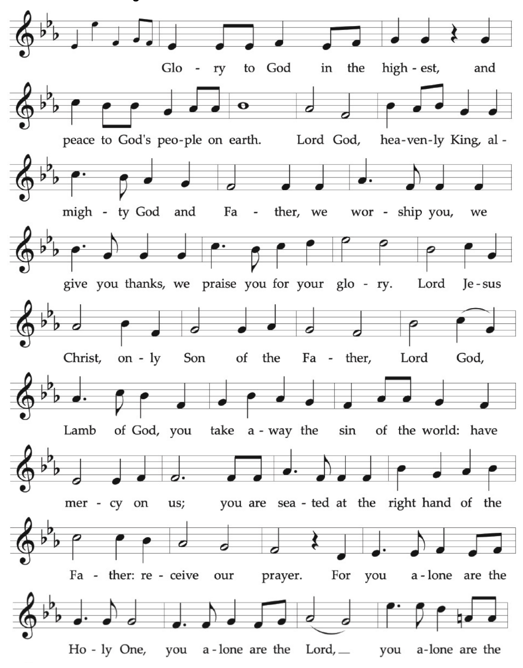
The Gloria Please stand to sing