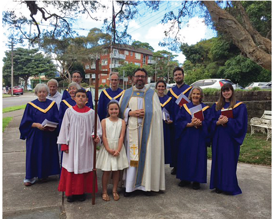
Easter Morning 2022

Where there are places and people around us that also need to experience