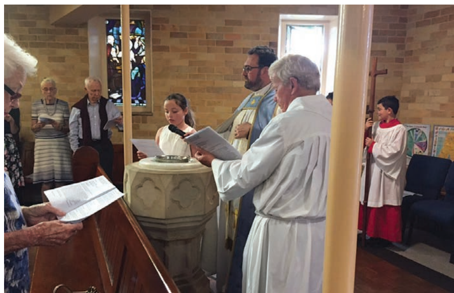
Renewing our baptism promises