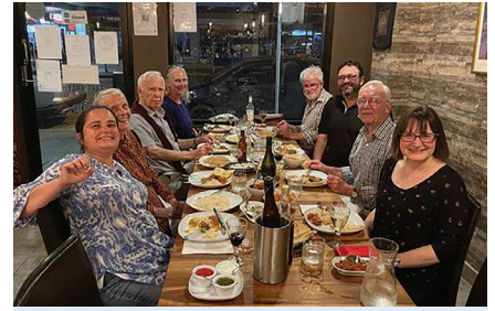
Book Club Dinner – October 2021

Jesus shows his love for us and for the world by dedicating himself to the restoration of humanity. He loved people along the way, he fed the hungry, healed the sick, restored people's dignity and brought life where people only saw death. This is our God who loves us still today and this is how we are called to live in the world.