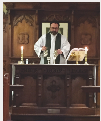
Thursday Eucharist in the Chapel

Now that COVID-19 restrictions have eased more, we have moved our Thursday Eucharist back into the Chapel. All parishioners are welcome to attend this mid-week service that provides a quiet, contemplative time in our busy lives. During school term times, some folk then adjourn to Café Jam in Bridgepoint for a light lunch and a continuation of fellowship. Come and join us!