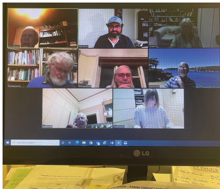
Trivia contestants 'zooming in' on the questions!

The St Luke's social studies Book Club finished reading Vivek Murthy's 'Together' a medical doctor's study of the impact of loneliness on health and wellbeing which offers deep insights into the healing power of human connections. This was particularly pertinent given the extended lockdowns we have experienced as a result of the COVID-19 pandemic. After a short recess the book club will embark on Hugh Mackay's 'Kindness Revolution' a reflection on Australia's most loved values of mateship, respect and harmony and a roadmap for entrenching these values solidly into the future. There's still time to join! We were fortunate to be able to celebrate the completion of our first book by enjoying dinner together at an Afghan restaurant in Balgowlah.