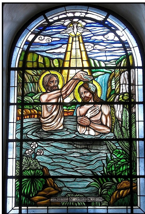
Jesus Baptised by John in the River Jordan (Stained glass window in the Malate Church, Manila.)

Canon from the Epistle from Fiori Musicali (Girolamo Frescobaldi)