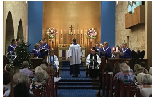
Above: Nine Lessons and Carols 2017

Cnr. Ourimbah Rd. & Heydon St. Mosman www.stlukesmosman.org