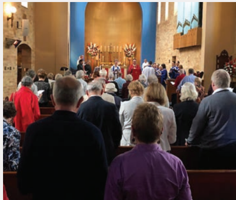
Patronal Festival of St Luke