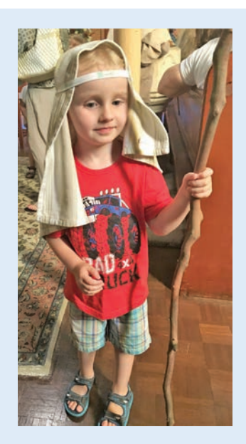
The Christmas Eve service offered a significant family encounter with the Christmas story.