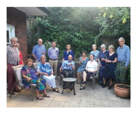
Parish groups wound up their programs with Christmas parties.