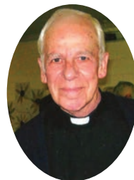
Our ministry team