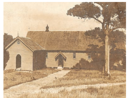
St Luke's church Bond Street