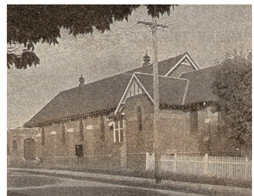
St Luke's church Heydon Street