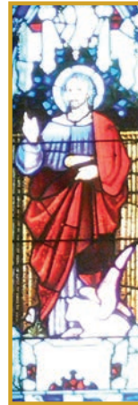
WWI memorial window

On 22 October we celebrate the festival of St Luke. What is a patronal festival? It is the time each year when a parish honours its patron saint. This custom can be traced to the ancient Christian practice of building churches over martyrs' tombs. The winged ox, above our church door, is the symbol of St Luke, evangelist and martyr. It signifies strength, service and patience.