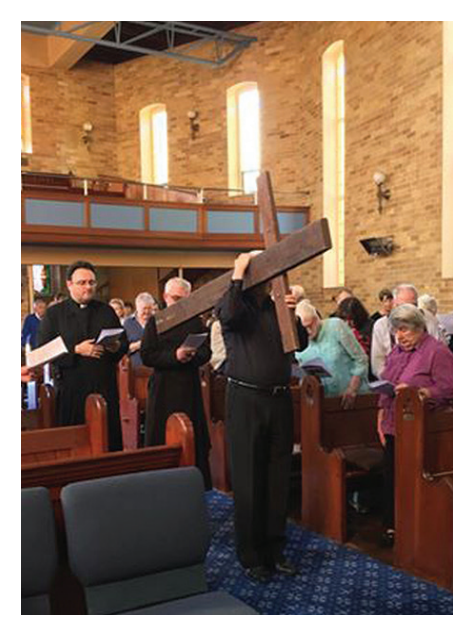
The Cross of Christ The Cross on which our Lord was hung

There has been an altering of cosmic proportions. God has fully shared our humanity so that we can partake in God's divine glory. And at Easter, we celebrate this cosmic change that has taken place by virtue of God's love for us, manifested in Jesus, now resurrected and victorious".